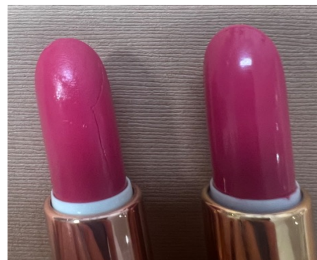
5% PERFORMA V-150 in Rescue Lip Color

PERFORMA™ V biopolymers can be used in applications from lipsticks to hair serums. In anhydrous systems, they provide gloss and help to prevent oil bleed in the stick applications. In hair serum formulations, shine and smoothness are easily achieved on all hair types Recommended use levels are 1-5%.